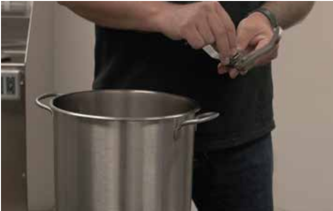
4. Place key way back into replacement blade.