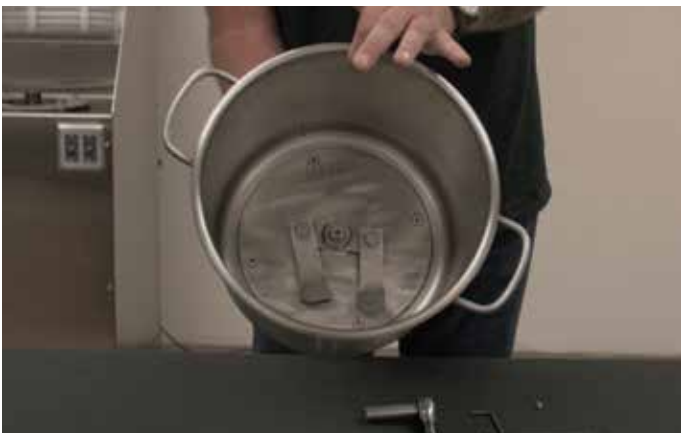
6. Make sure blade lays on top of washer welded to bucket.