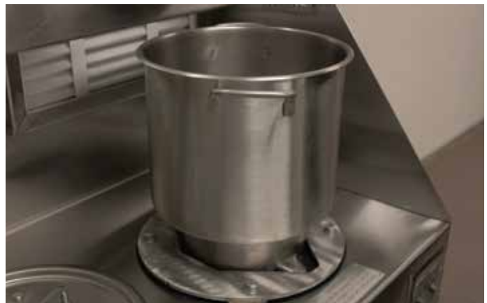
9. Place bucket on unit and lock into place.