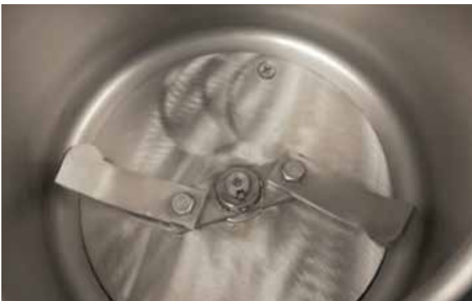
8. Check to see that blades spin.