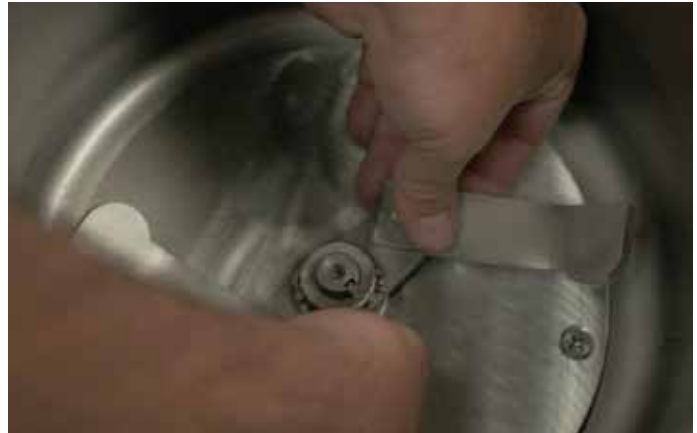
5. Slide on securely.