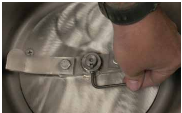
7. Replace set-screw and tighten with allen wrench.